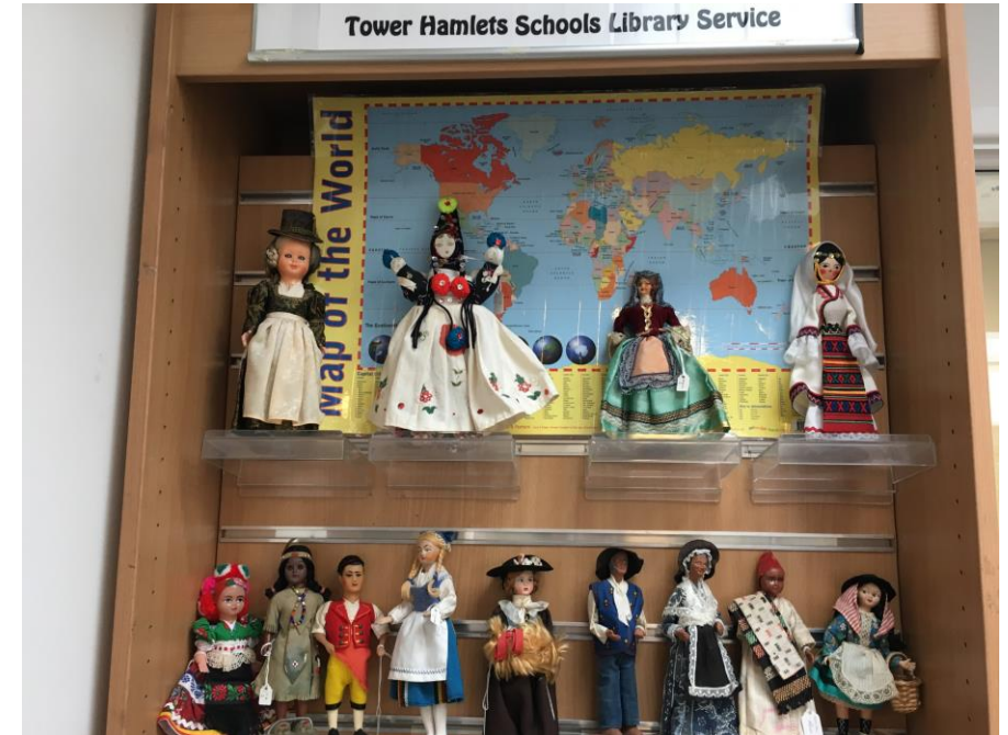
Costume dolls from around the world