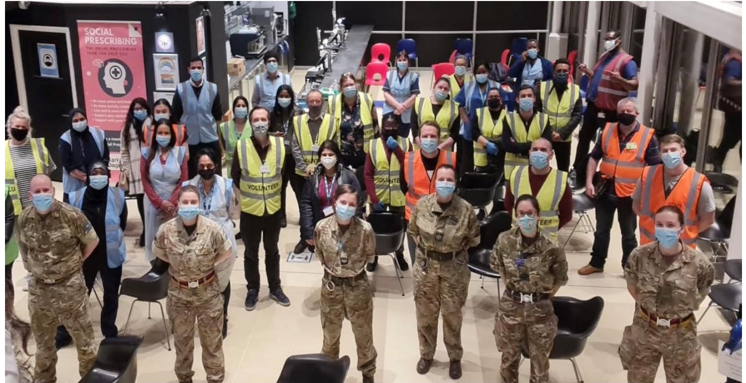
Broadway Theatre Barking, was a Covid Vaccine Centre during 2020 - 2021.