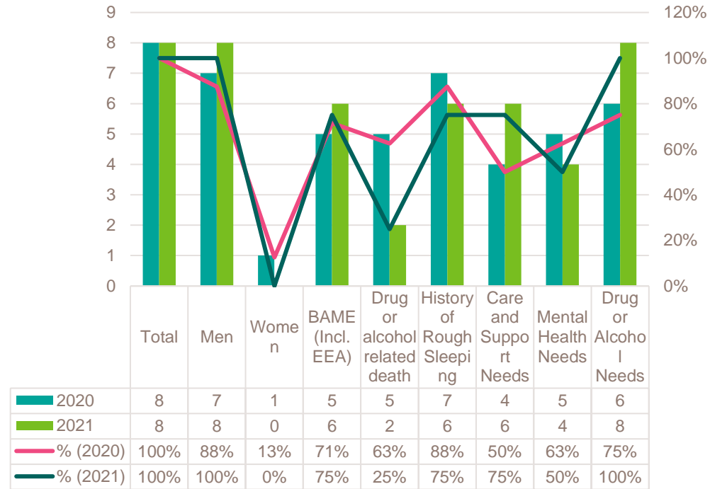
Support Needs and Histories