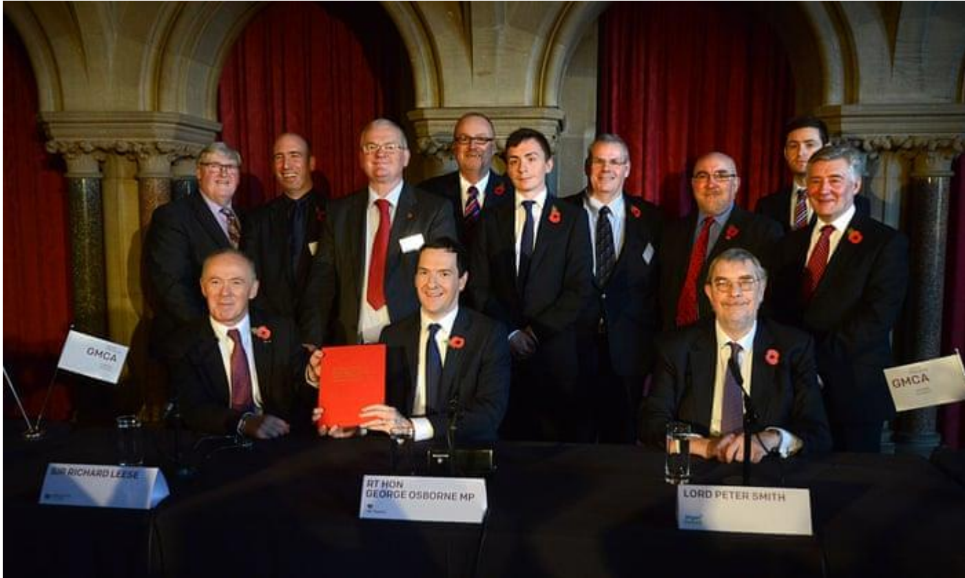
The Northern Powerhouse