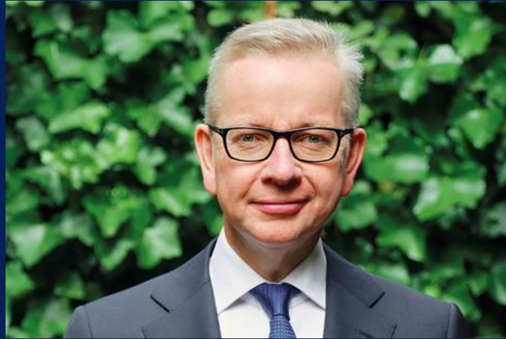
Michael Gove MP Secretary of State for Levelling Up, Housing and Communities