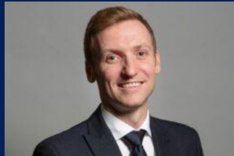
Lee Rowley MP Parliamentary Under Secretary of State for Local Govt & Building Safety