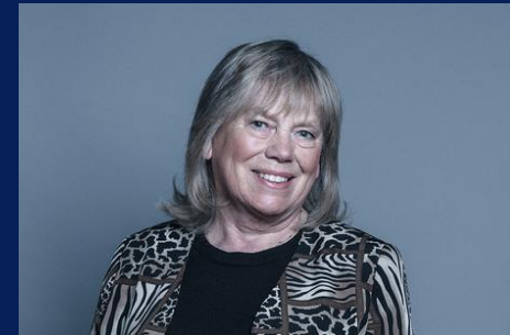
Baroness Scott of Bybrook Parliamentary Under Secretary of State for Faith & Communities