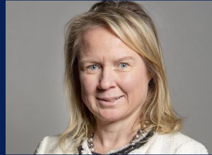
Felicity Buchan MP Parliamentary Under Secretary of State for Housing & Homelessness