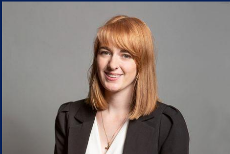
Dehenna Davison MP Parliamentary Under Secretary of State for Levelling Up