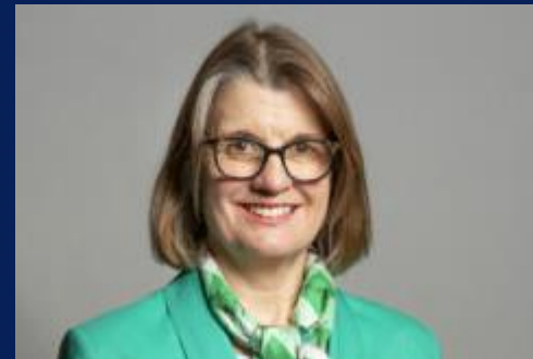
Rachel Maclean MP Minister of State for Housing & Planning